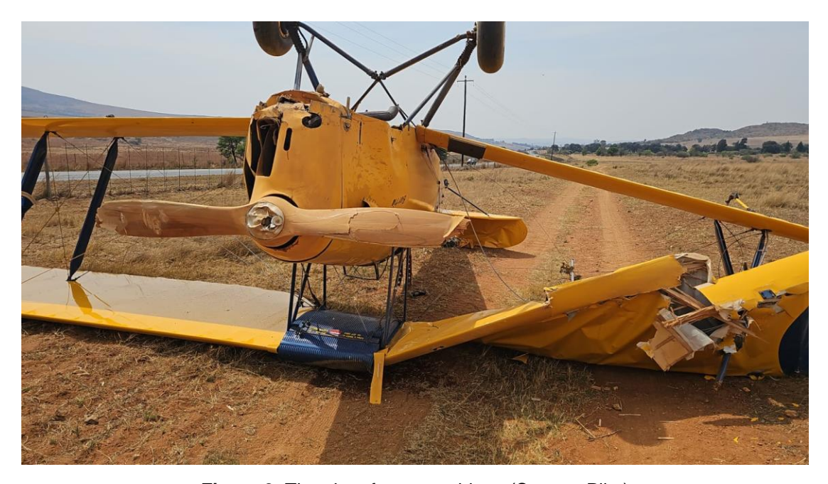
Figure 3: The aircraft post-accident.