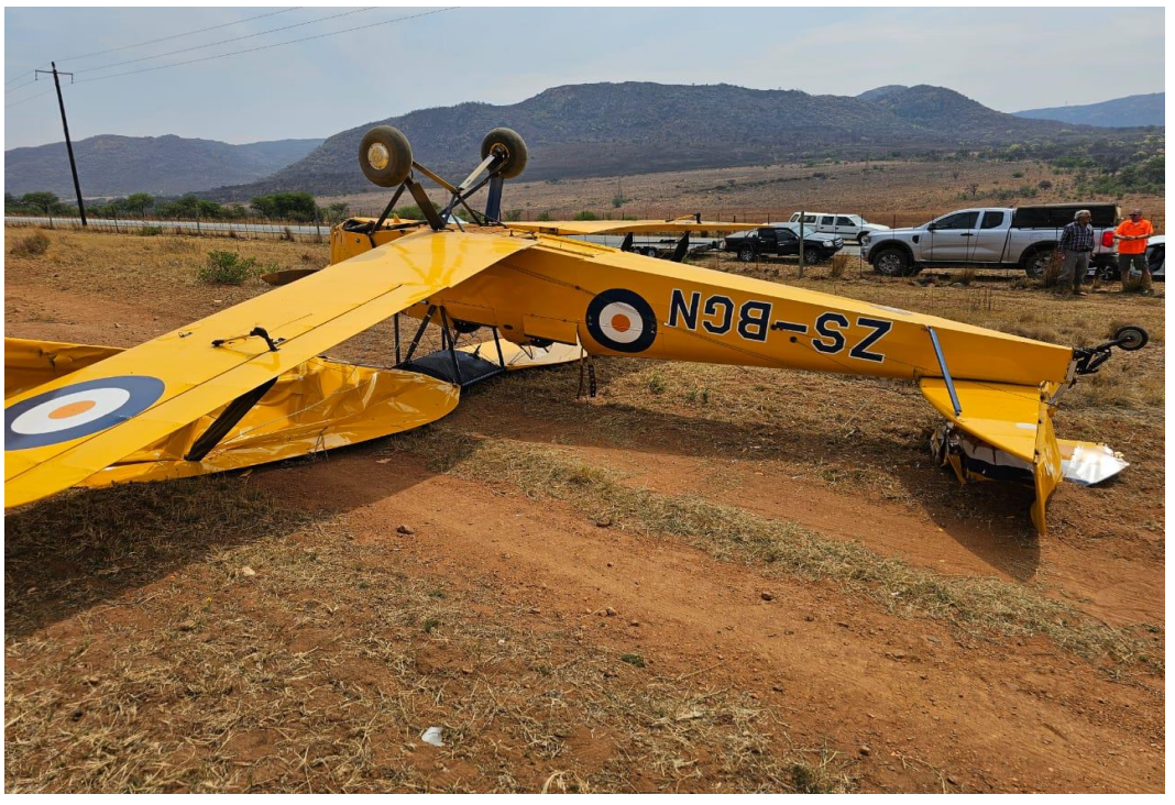
Figure 4: The aircraft in an inverted position post-accident.