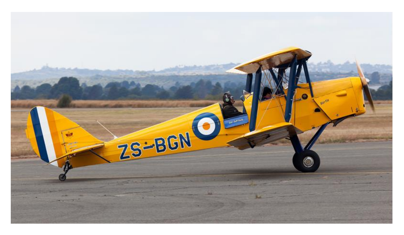
Figure 1 : The file picture of ZS-BGN aircraft.

Accident - Preliminary Report AIID Ref No: CA18/2/3/10501